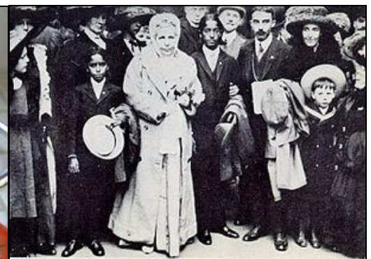
JK with Annie Besant & George Arundale

The town experienced several natural calamities like floods, famines and epidemics.