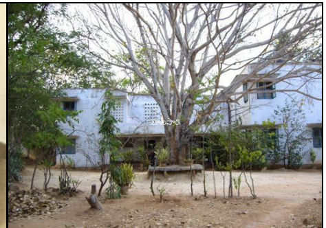
Student on meet on Tagore at BTC