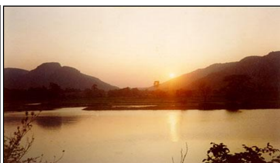
Sun Set at the Valley

Over the past three decades the Centre has built solid bridges to the local village population through our work in rural education, rural health, reforestation, bio-diversity conservation and watershed management. In the 1980s, a fledgling rural education programme was given a boost through a Government of India grant. This enabled the evolution of a multi-grade learning system that addresses many of the entrenched problems of rural education. Finding wide applicability in many parts of India more recently in Ethiopia, the rural education programme at Rishi Valley has become something of a model that various agencies draw upon. Many of them (including UNICEF and various state governments) have collaborated with us in training teachers and propagating this method of education in several regions across the country.