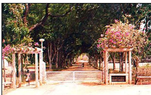
Rishi Vally School Gate