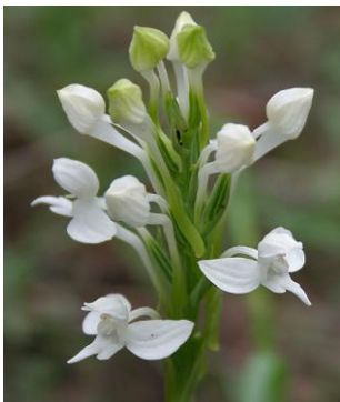
Habenaria at Talakona

There is a 240 meter long canopy rope walk, about 35 to 40 feet height, giving a thrilling experience to the visitors while walking. There are mighty trees around with birds and monkeys accompanying during the canopy walk. There are number of trek routes in different categories giving an option for you to choose a route that fits you. You also come across an ancient Siva temple Sri Siddheswara Swamy which is flooded with devotees during Sivarathri festival. There are also deep caves scattered over the mountains where it is believed that sages meditate eternally. A stream line flows near canopy walk area where a bathing ghat is under construction.